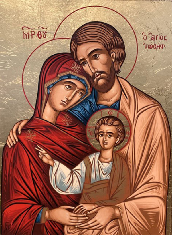
Icon of the Holy Family in St Martin's Church