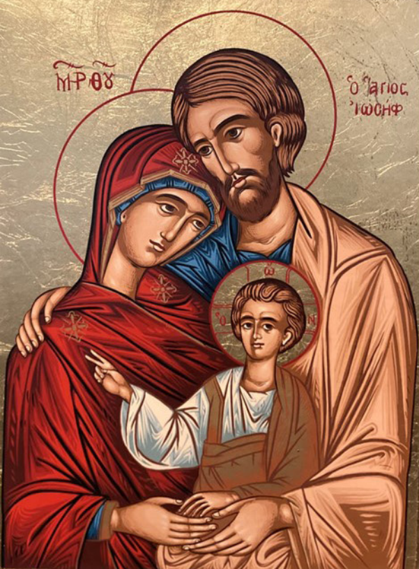
Icon of the Holy Family in St Martin's Church