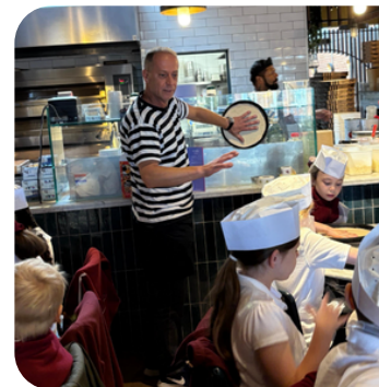
Fun at Pizza Express in Year 4