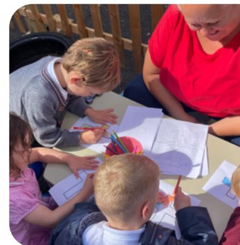
Reception learning outside