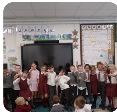
Year 2 children saying their school council manifestos

This week the children have been putting themselves forward for different jobs in their classes, including School Councillors, RE Ambassadors and our Head Students. Keep an eye on Class Dojo to find out who will be representing our school this year.