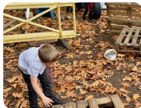
Enjoying our Construction Area