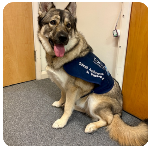
Storm, our new therapy dog