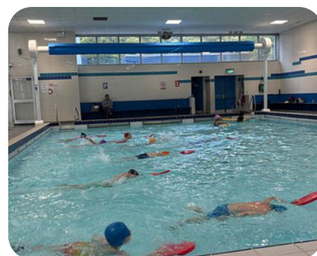
Year 4 swimming at Highgrove