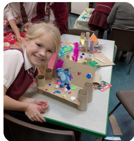
D&T in Year 2 making a chair for Baby Bear!