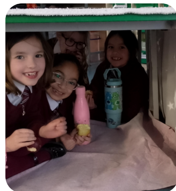
Year 2 had fun making their own huts for the Jewish festival of Sukkot