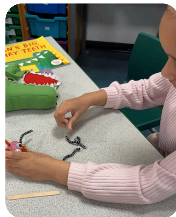
Children got to enjoy lots of different fun activities for World Book Day