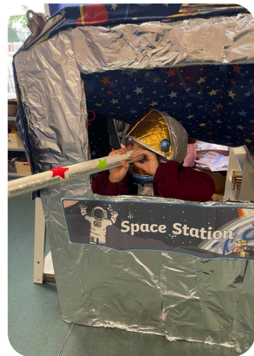
Reception in space!