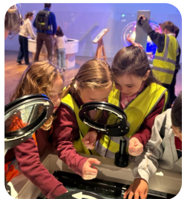
Year 4 had a great time at the Science Museum