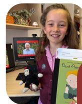
Celebrating David Attenborough

Our Year 6 pupils have been working extremely hard in preparation for their SATs assessments next week. We are very proud of the commitment and resilience they have shown, and we look forward to starting each morning together with our special SATs breakfast.