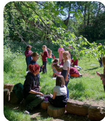
Year 3 made the most of the (little) sun we had this week!