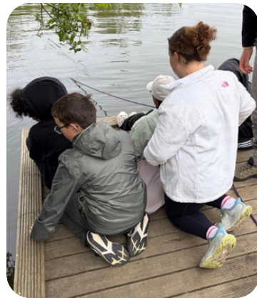
Our year 6 children about to get wet in Wales!