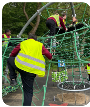
Fun at the Lido!