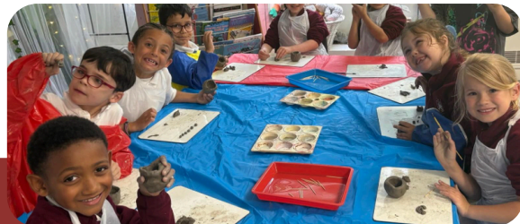
Great fun making pinch pots in year 2 this week!