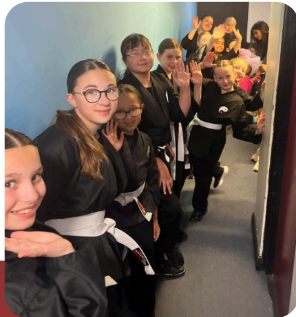
Well done Futurity dancers!