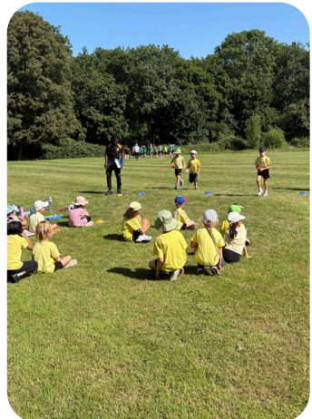
Glorious Sports Day weather!