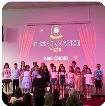
Performance night was amazing