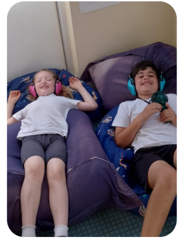
Keeping cool and calm!