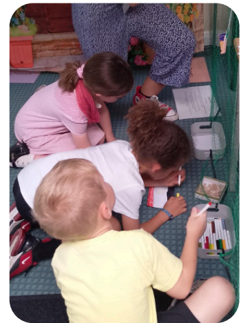
Time in the prayer space!